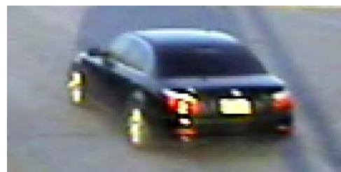
Vehicle similar to suspect's

The attempted abduction occurred on February 15, 2013, in the Kouma Village/Liberty Village area on Fort Hood.